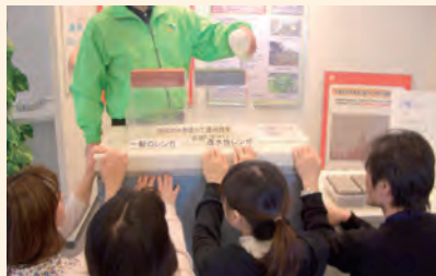
A picture of an experiment that uses permeable bricks

Various problems related to the environment, such as air, water, undesired noise, waste, energy, and global warming issues are becoming complex as the years go by, and they are challenges to be solved urgently. At the Osaka ATC Green Eco Plaza, an exhibition of the latest technologies that help the environment by addressing these challenges can be viewed. Moreover, seminars and events that help to form the environment are held constantly.