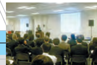
Biotope Plaza A seminar room that accommodates a maximum of 150 people.