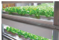
Zone with security/safety of food and environment of food as the focus. A vegetable production plant is installed.