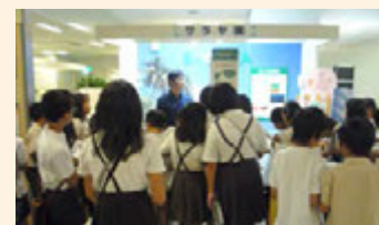
Used for environmental education for students, from elementary, middle, and high schools to university.