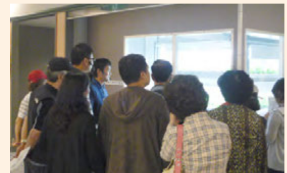
Many customers visit from overseas as a part of observation and sightseeing.