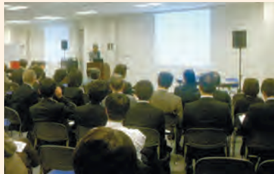
Seminars, to which specialists in environmental businesses are invited, are held constantly.

At the Osaka ATC Green Eco Plaza, we introduce the latest information on environmental problems, providing hints for environmental responses and countermeasures that are essential for corporations. Moreover, with respect to environmental businesses, which will increasingly diversify in the future and are expected to continuously grow by expanding their possibilities, we support new environmental businesses through the provision of corporations' advance program information and seminar sessions.