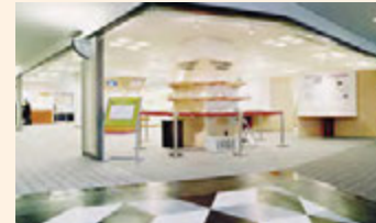
At the 3 R education zone, knowhow is introduced with reduction of waste as its focus.