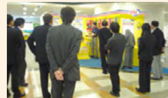
Visited by corporations for environmental training purposes.