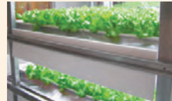
A vegetable production plant is installed inside the building