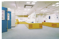
With the cooperation of the Japan Environment Association (Foundation), we exhibit a broad range of eco-mark certified products.