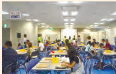
Sunday craft classes are held on the 2nd and 4th Sunday of every month.