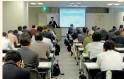
The latest information and trends on environmental businesses can be obtained.