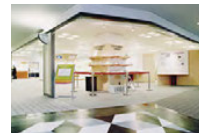
At the 3 R education zone, knowhow is introduced with the reduction of waste as the focus.